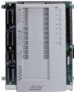
Flexible 32-Point Raptor Controller