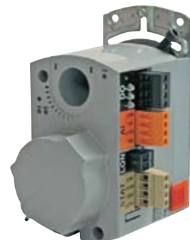
Predator VAV Actuator