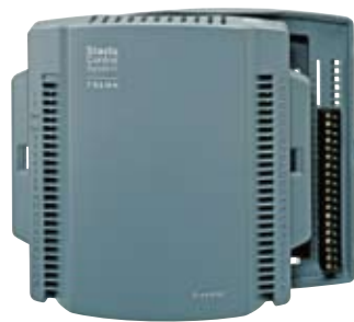
Predator Controller Family