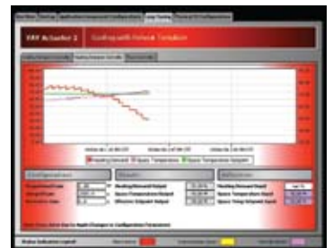
All reports, logs, histories, audits, etc. are easy to access and can be exported to standard file formats.