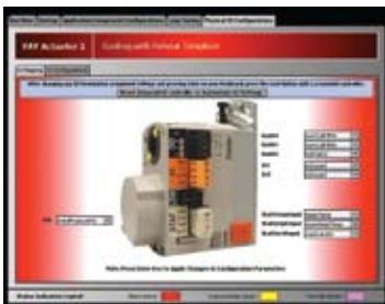
Assign I/O terminations visually.

Practical TALON can access and control a Staefa legacy control system, eliminating the need to replace already-installed controls.