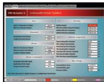
Monitor space temperatures and essential parameters through system reporting.