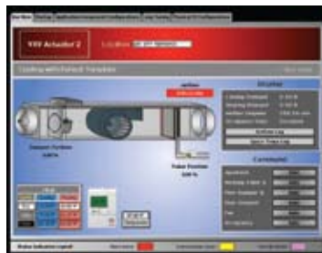
Live data is integrated into animated control system graphics.