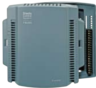
Predator Controller Family