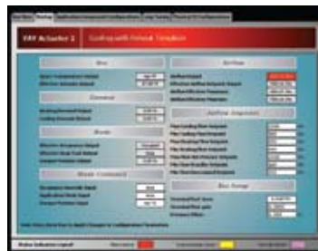
Monitor space temperatures and essential parameters through system reporting.